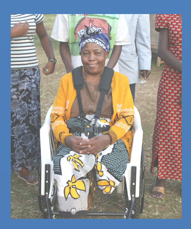
A grateful woman who received a wheelchair.

Email: nhihtanzania@gmail.com www.nhihtanzania.org